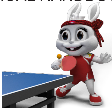
TABLE TENNIS TECHNICAL HANDBOOK